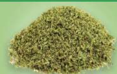
MARJORAM LEAFS DEHYDRATED