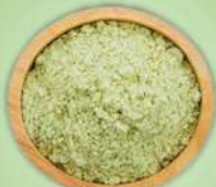
Neem seed protein