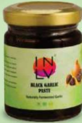
BLACK GARLIC PASTE