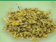
SENNA LEAFS DEHYDRATED