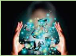
Research & Innovation