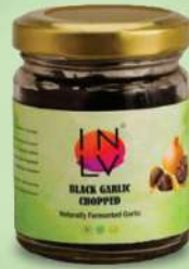
BLACK GARLIC CHOPPED

It is loaded with Vitamins, Vitamin B1, Vitamin B6, Vitamin C, Manganese, Selenium, Phosphorus, Copper and many more.