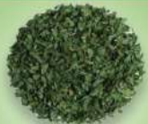
SPINACH DEHYDRATED LEAFS