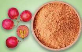
Grape seed protein