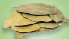
BAY DEHYDRATED LEAFS