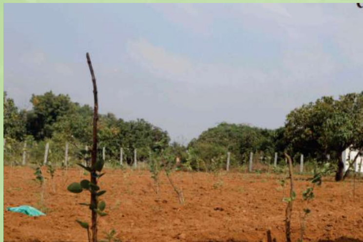
Farming seeds & Plantation