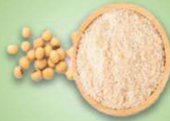
Soya bean Protein