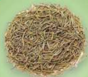
ROSEMARY LEAFS DEHYDRATED