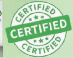
Certified Manufacturing Facilities