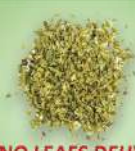
OREGANO LEAFS DEHYDRATED