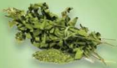
MORINGA DEHYDRATED LEAFS