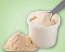
Guava seed protein