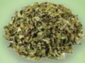
TULSI DEHYDRATED LEAFS