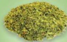
CORRIANDER DEHYDRATED LEAF