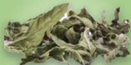
MINT DEHYDRATED LEAFS