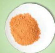
Tomato seed protein