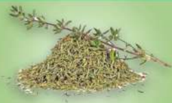
THYME LEAFS DEHYDRATED