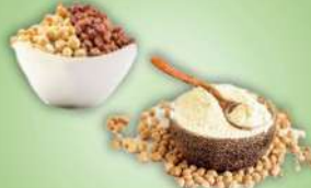
Chick pea protein