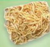
MUSLI ROOT DEHYDRATED