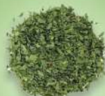
METHI DEHYDRATED LEAFS