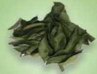
CURRY DEHYDRATED LEAFS