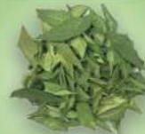
NEEM DEHYDRATED LEAFS