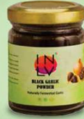
BLACK GARLIC POWDER