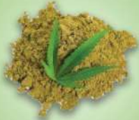
Hemp Seed Protein