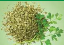
PARSLEY FLAKES DEHYDRATED