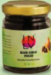
BLACK GARLIC PEELED (WHOLE)